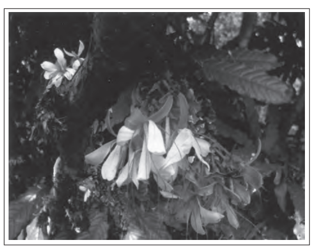
Figure 14.3: Humbodtia decurrens Bedd — highly rare endemic tree of Southern Western Ghats (India)

There is an urgent need to educate people to adopt environment-friendly practices and reorient their activities in such a way that our development is harmonious with other life forms and is sustainable. There is an increasing consciousness of the fact that such conservation with sustainable use is possible only with the involvement and cooperation of local communities and individuals. For this, the development of institutional structures at local levels is necessary. The critical problem is not merely the conservation of species nor the habitat but the continuation of process of conservation.