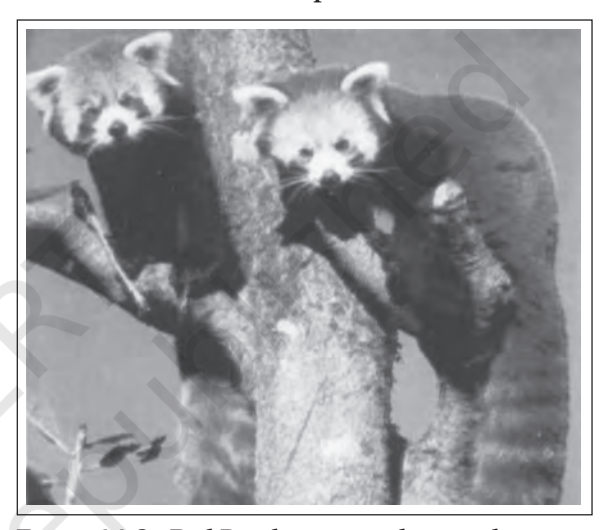
Figure 14.2: Red Panda — an endangered species

It includes those species which are in danger of extinction. The IUCN publishes information about endangered species world-wide as the Red List of threatened species.