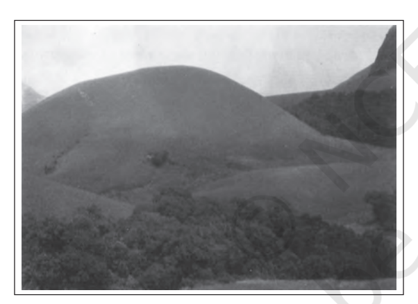
Figure 14.1 : Grasslands and sholas in Indira Gandhi National Park, Annamalai, Western Ghats — an example of ecosystem diversity

You have studied about the ecosystem in the earlier chapter. The broad differences between ecosystem types and the diversity of habitats and ecological processes occurring within each ecosystem type constitute the ecosystem diversity. The 'boundaries' of communities (associations of species) and ecosystems are not very rigidly defined. Thus, the demarcation of ecosystem boundaries is difficult and complex.